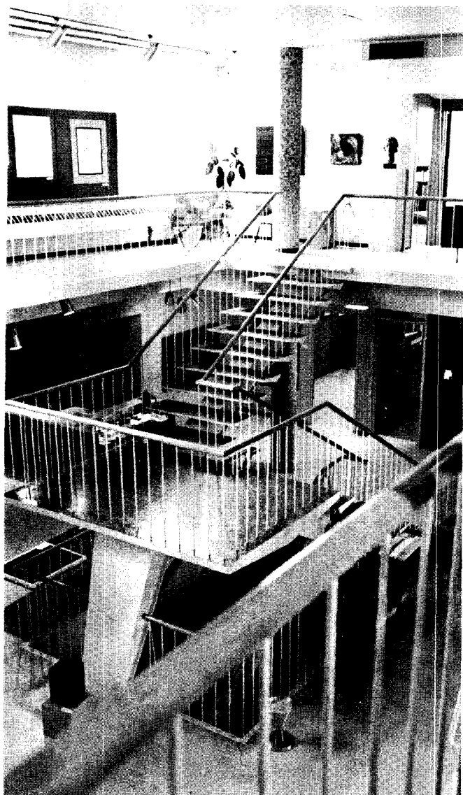
Tweed Art Gallery—Duluth Campus

June 30, 1967 marks the completion of the 115th year of University operation. This is a report of the dollars which the people of the State through the Legislature, the Federal Government, our local and national industries and foundations have entrusted to the University for teaching, research and service.