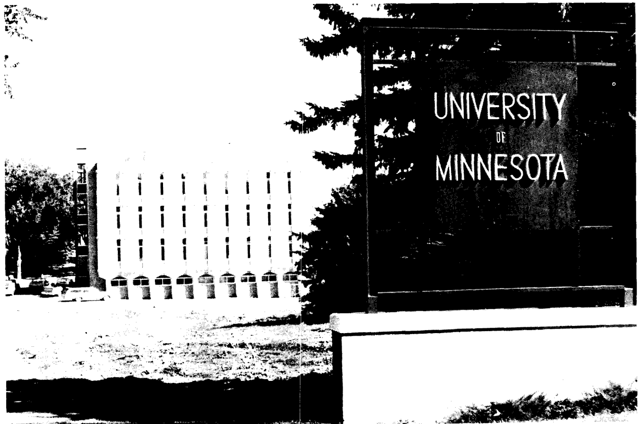
Science Building—University of Minnesota, Morris