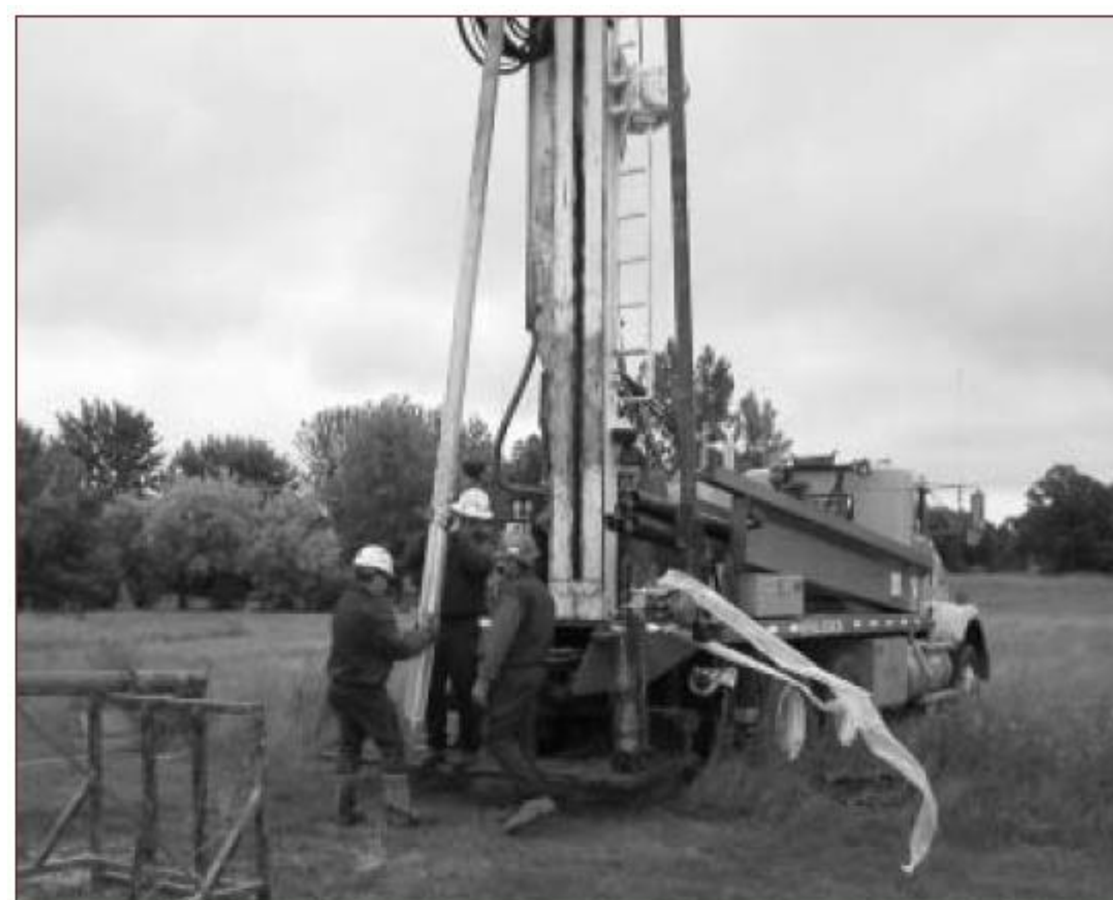
Figure 2: A picture of the machinery used to extract the core till samples from the sites, Courtesy of Ericson and Barnes (1). All samples were sterile and are stored in freezers to prevent any microbial growth.