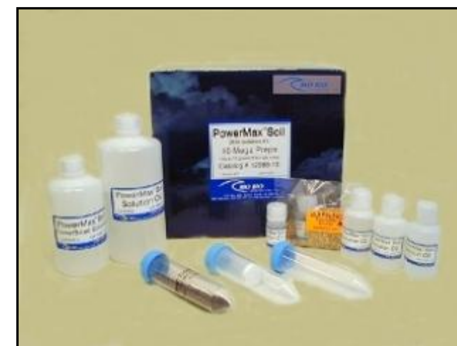
Figure 4: Example of one of four DNA extraction kits performed on sediment samples.