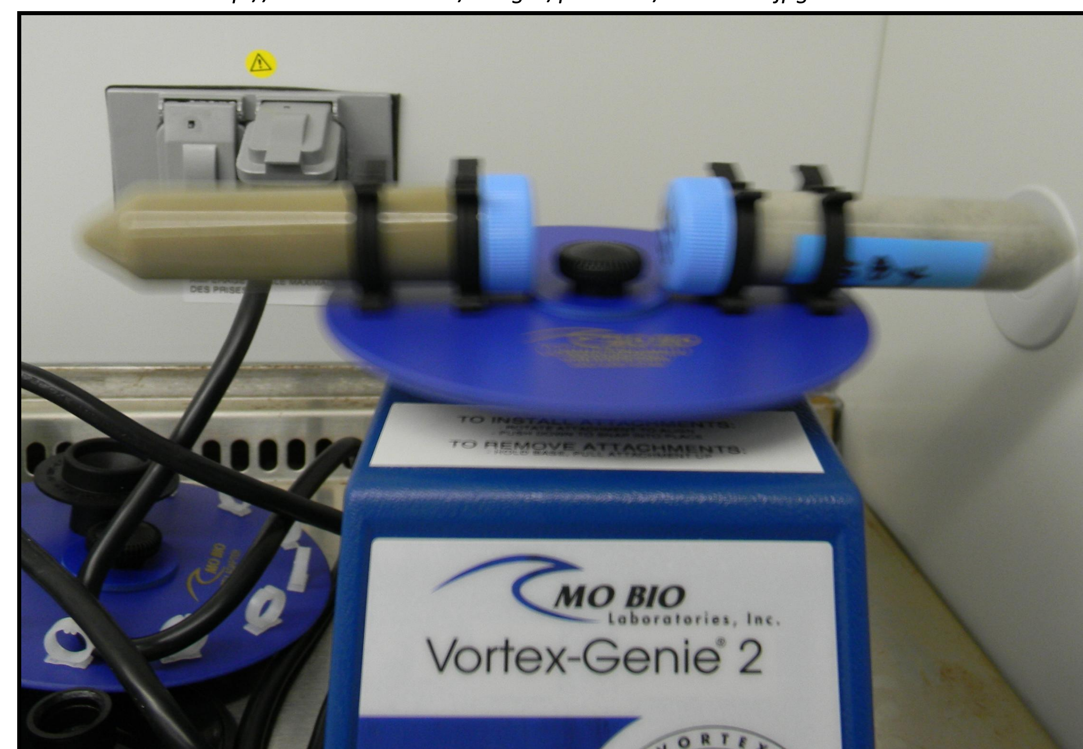
Figure 5: Sediment sample in preliminary DNA extraction step where the cells are mechanically agitated in the presence of glass beads on a vortex machine in order to free DNA from the cell structure.