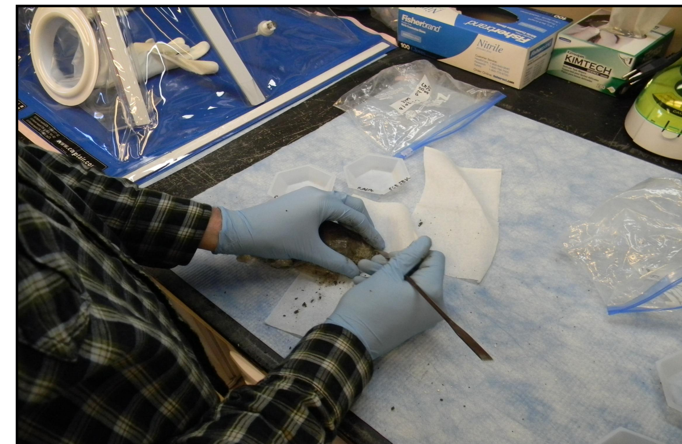
Figure 3: Preparing sediment samples for the extraction process. Two of the kits used had a capacity of 0.25g sediment while the other two allowed for up to 10g of sediment.