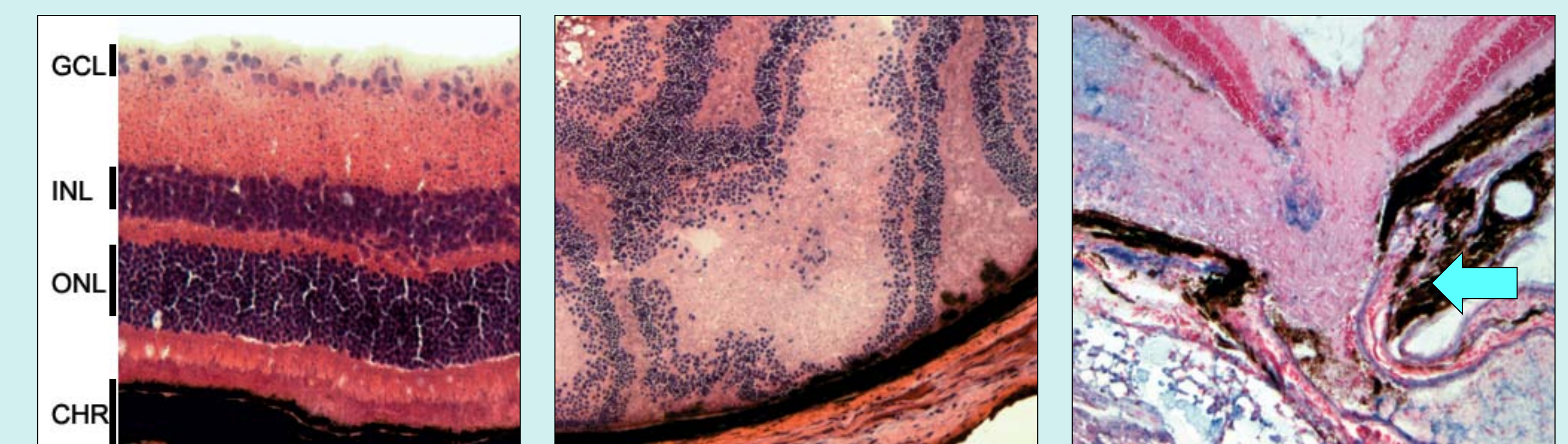
Figure 2. Hurler's Retinal Morphology. a) Wild-type mouse retina. b) Hurler retina showing a disorganization of retinal layers and GAG deposits. c) Hurler retina where optic nerve fails to exit the eye.