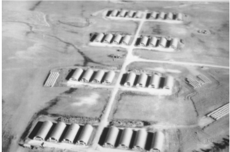
◆ Hoops can be used on any scale, from a single unit to large multi-unit facilities.

Hoop structures do not have the problems with heavy snow loads that cause failures of standard farm buildings. Snow does not accumulate as much on the structure's curved roof, and heat from the pigs and composting bedding causes snow to slide off. Also, any ice formed on the roof can be cleared from the ground level.