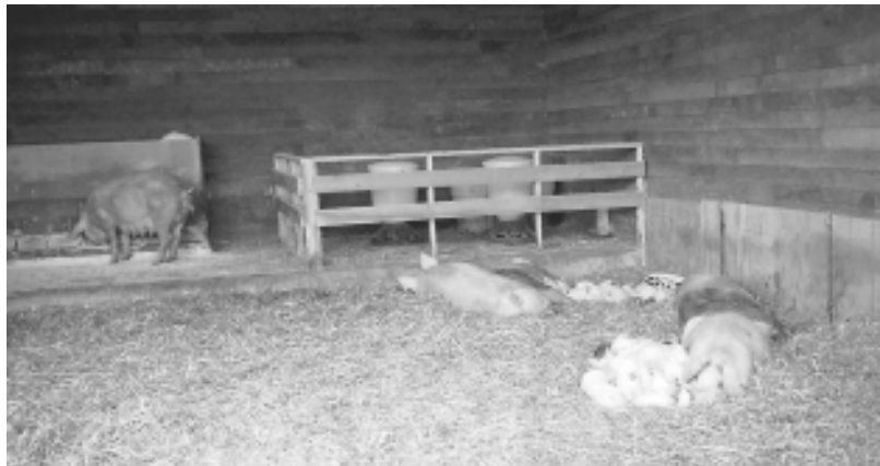
◆ A raised feeding platform and creep area keeps straw and other bedding off the feeding area.

Throughout the farrowing process, sows are maintained in groups of 8 to 12, and sows within a group are bred to farrow within five days of one another to minimize size differences among their piglets. Generally, there are two different methods of farrowing used in Swedish deep-bedded systems. One version allows the sows to farrow in boxes and still interact as a group. The farrowing boxes are removed 7 to 10 days after farrowing, allowing the pigs and sows to co-mingle. In the second version, the sows farrow in individual pens, and at 14 to 21 days the pigs and sows are moved to a group nursery setting.