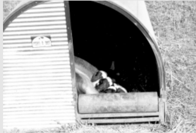
◆ Sow and litter in pasture hut.

For the March-April farrowing, Port-A-Huts™ are assembled inside the hoops. Sows choose their own Port-A-Hut™ during gestation, and Jim and his son Josh surround the huts with straw that sows can walk on before and after farrowing. Two weeks after farrowing, the huts are removed and two to three 1,800-pound round bales of straw are added to create a deep-bedded group nursery. Jim adds straw to the hoop structure as necessary until the sows are moved out on pasture, usually five to six weeks after farrowing. "At five to six weeks we open the gates," Jim says. "The sows walk out of the building directly to the pasture."