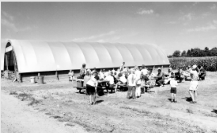
◆ In 1996 the Moultons hosted a picnic just 10 feet from their hoop structure and composting manure packs.