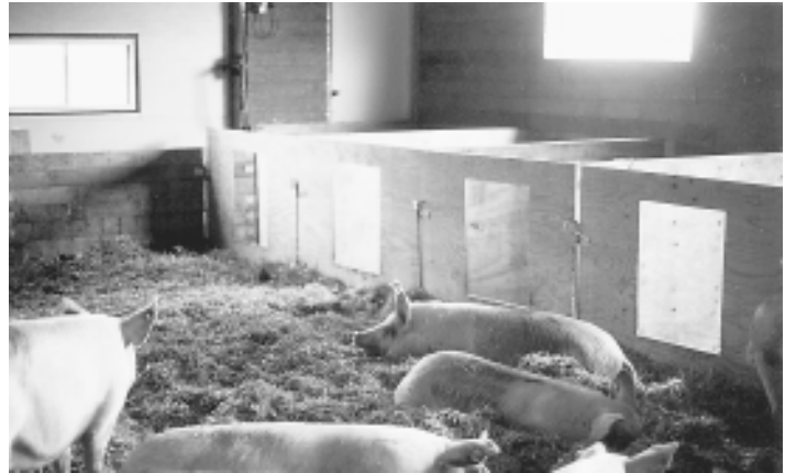
◆ Swedish type farrowing boxes. Group housing improves the well-being of the animals.

The Swedish deep-straw farrowing system is based on the animals' natural behavior and involves carefully planned production, maintenance of sows in stable groups, longer nursing periods, and deep-straw beds for the sows during nursing and weaning (Halverson et al., 1997). Successive groups of sows move through the system in a continuous process.