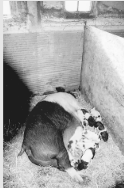
◆ Sow with pigs inside retrofitted dairy barn.

Gestating and lactating sows are divided into separate paddocks by an electric fence. Dwight beds Port-a-Huts™ with about one-fourth to one-third of a bale of straw at the beginning of the pasture season, but eventually adds up to three-fourths of a bale. "It is critical that you plan on using three-fourths of a bale of straw [per sow] in an average season," he advises. "You don't want to be stingy on straw."